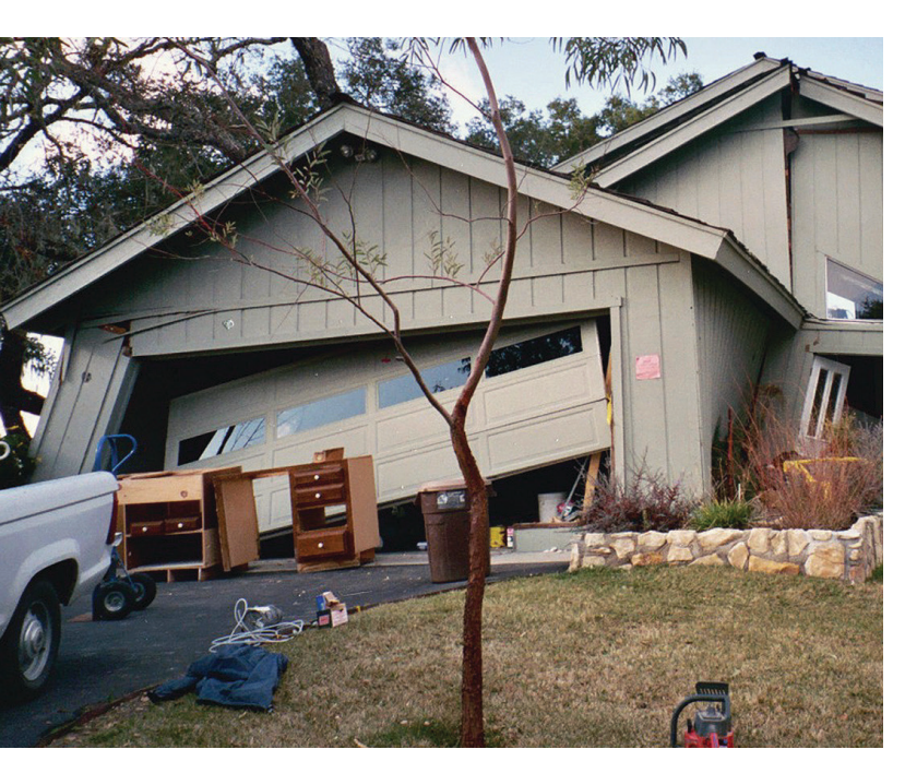
(ABOVE) ATASCADERO, CA JANUARY 25, 2004 -- THIS HOME SLID TWO FEET OFF ITS FOUNDATION DUE TO THE 6.5 SAN SIMEON EARTHQUAKE.